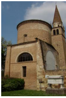
Albert Azzo II tomb Vangadizza Abbey Badia Polesine