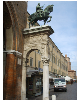
A statue of Leonello's father, Niccolò III d'Este. It is a 20th-century replica, before the Town Hall of Ferrara (Palazzo Municipale), of the 15th century equestrian bronze monument to Niccolò III of Este. The original statue is attributed to Leon Battista Alberti.